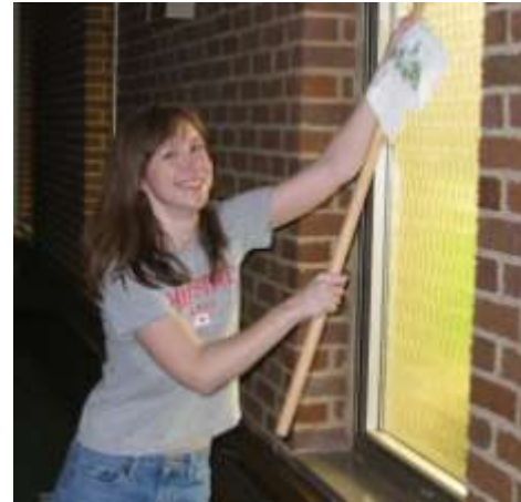
Lisa Simpson does windows.